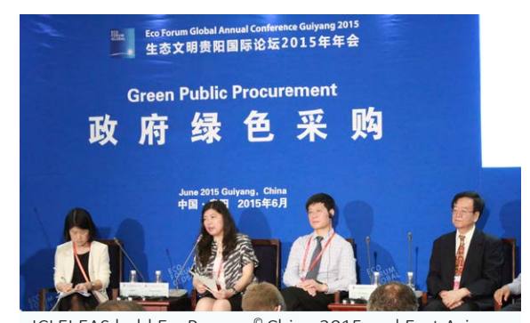
ICLEI EAS held EcoProcura<sup>©</sup> China 2015 and East Asia Regional Executive Committee Meeting in Guiyang City in June 2015.