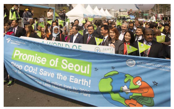
Launched by Seoul, the Promise of Seoul represents the city's determination and ambition in reducing carbon emissions.

Three major initiatives and networks were launched: CityFood, 100% Renewable Energy ICLEI Network, and the Global Lead Cities Network on Sustainable Public Procurement. Furthermore, 11 MoUs between ICLEI and relevant partners were signed at the congress.