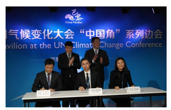
EAS signed MoU with Shenzhen Development and Reform Commission and Shenzhen Low-Carbon Development Foundation at COP21.