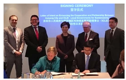
Guiyang City signed a letter of intent to express its interest to join ICLEI in November 2015 during a visit to Berlin, Germany.

Our latest member is Guiyang City. Located in Southwestern China, Guiyang is the provincial capital of Guizhou Province, with a population of around 4.7 million. The city's achievement in implementing ecological civilization has been widely recognized in the country. After the approval from China's National Ministry of Foreign Affairs and the Government of Guizhou Province, the city officially joined ICLEI in January 2016.